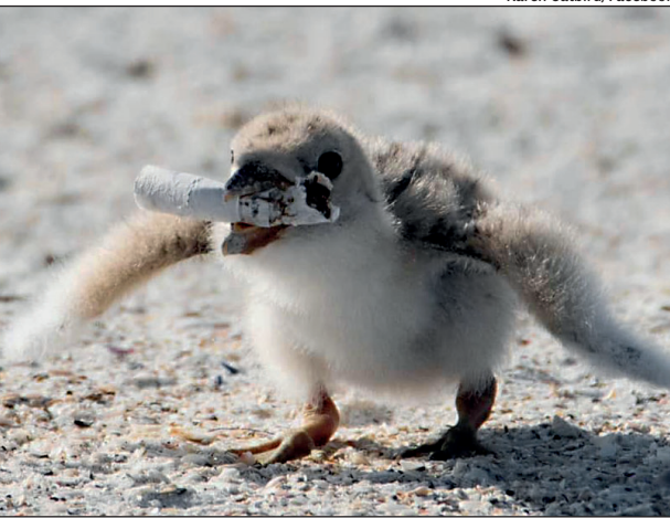
simple plea as she posted the pictures online: 'If you smoke, please don't leave your butts behind. It's time we cleaned up our beaches and stopped treating them like one giant ash tray. #nobuttsforbabies'. Cigarette butts were the most common item of all types of rubbish collected from beaches globally. THE INDEPENDENT