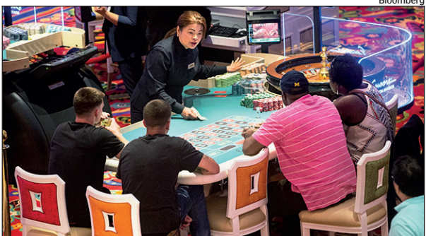
In general, the higher the risk appetite, the more a gambler stands to lose and the more profit a casino tends to make, sometimes up to 10 times more

The new technology uses algorithms that process the way customers behave at the betting table to determine their appetite for risk. In general, the higher the risk appetite,