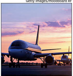
THE HEAT IS ON: The tracks linger in the sky as ice clouds and trap heat in the atmosphere. This is an unaccounted source of climate warming from air travel

Overall air traffic is set to be four times larger in 2050 compared with 2006 levels, but planes are generally fly-