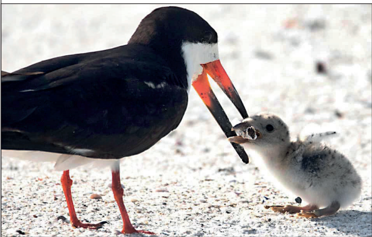
A parent bird has been spotted feeding its chick a cigarette butt, highlighting environmental concerns and prompting a wave of anger at careless smokers. The black skimmer bird was photographed at a beach in Florida, US, picking the butt up and putting it in the baby's mouth. Karen Mason, who took the photographs, issued a