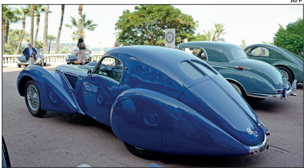
Average US vehicle age this year hit record 11.8 years and is still rising

Detroit: The average age of cars and trucks in the US has hit a record 11.8 years, as better quality and technology allows people to keep them on the road longer.